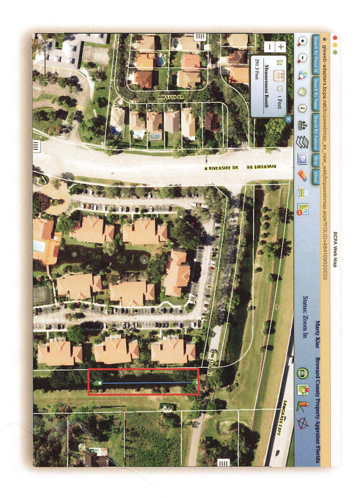
EXHIBIT "B" SITE AERIAL(S)